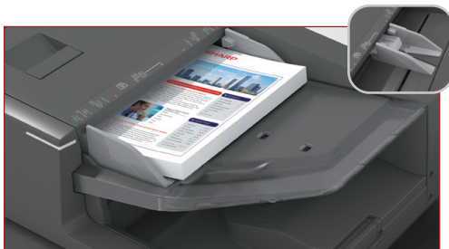
High capacity 300-sheet DSPF with 150-business card feeder for increased efficiency and scanning capabilities.