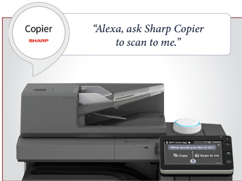
MX-8081 shown with available Sharp MFP Voice feature with Amazon Alexa.